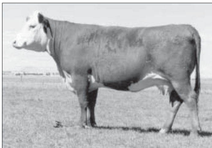
HH Miss Advance 339C

♦Balanced trait bull that is well made and correct.