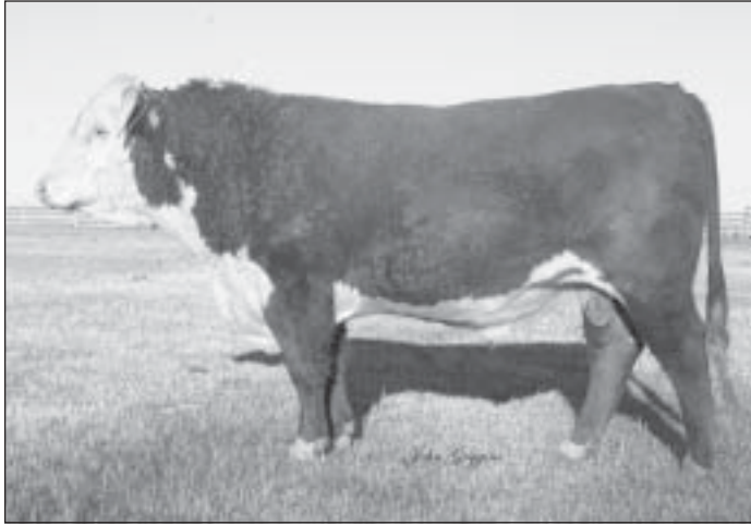
HH Advance 396N