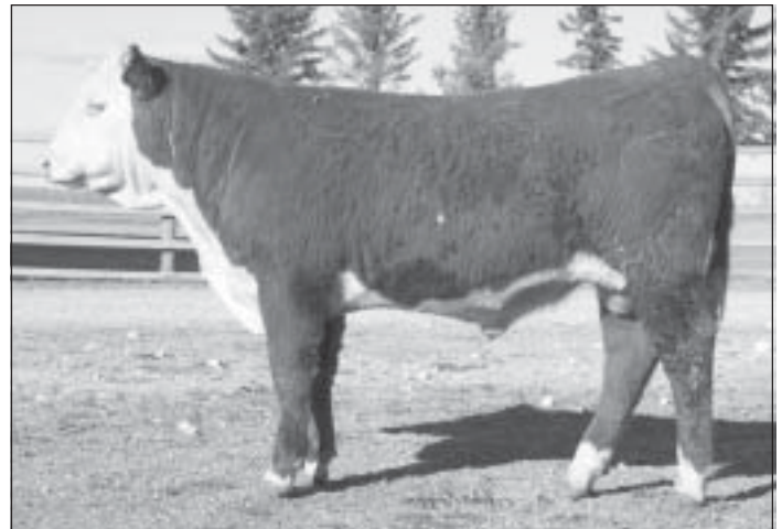
HH Advance 4153P

♦ "4153" is a powerful herd bull prospect with exceptional length of body. He is well marked and has super individual performance. His dam is a Dam of Distinction and has an average NR of 107.