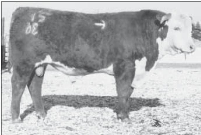
CL 1 Domino 2136M

BD: 1-27-02 ♦ Reg: 42270256 ♦ Tattoo: 2136 ♦ Bull