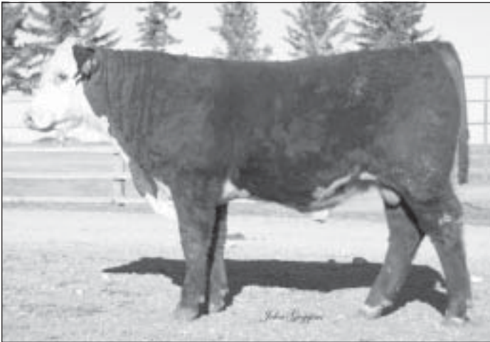
HH Advance 4126P

♦Well marked, stout made bull with balanced EPD's and solid performance.