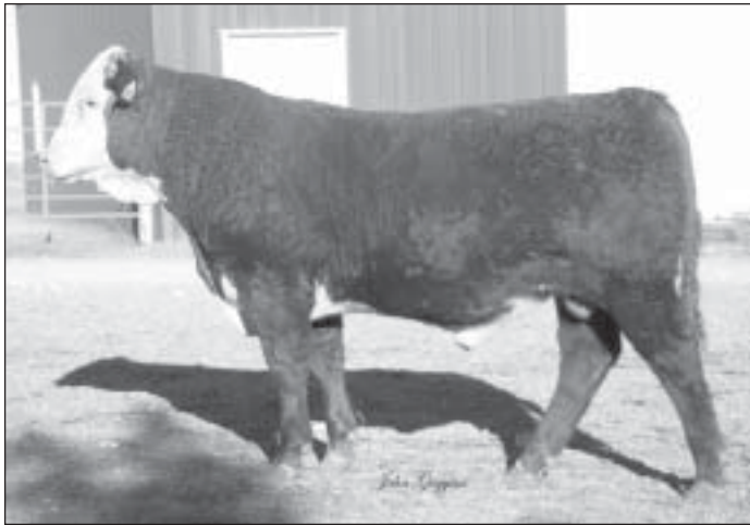
HH Advance 4136P

♦ "4138" is a big, long bodied herd bull prospect with lots of volume and muscle shape. He has powerful EPD's across the board and scanned a 14.4 inch REA. His dam is the great 93451 Miles City cow, and we feel she is one of the best cows ever produced there. This bull has a lot of future and a lot of potential.