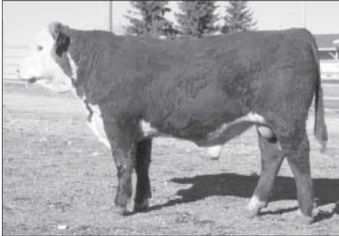
HH Advance 4170P

♦ "4175" is the result of a half brother- half sister mating. He should really produce some pop on an unrelated set of cows.