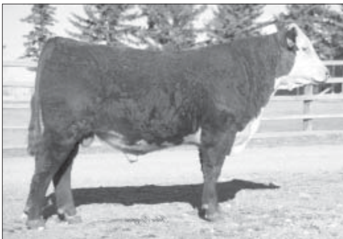
HH Advance 4013P

♦ Strong growth and maternal prospect with good EPD's. Dam is a daughter of the 550 cow that was the 2 nd high seller in our 2001 cow sale.