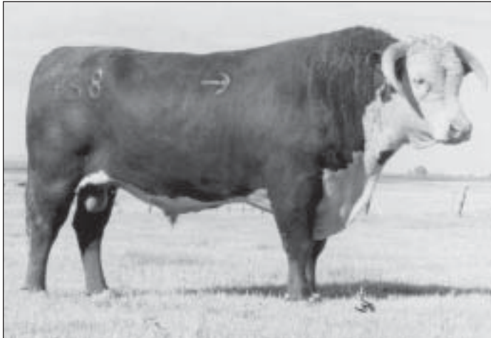
CL 1 Domino 824H

BD: 1-17-98 ♦ Reg: 41011011 ♦ Tattoo: 824 ♦ Bull