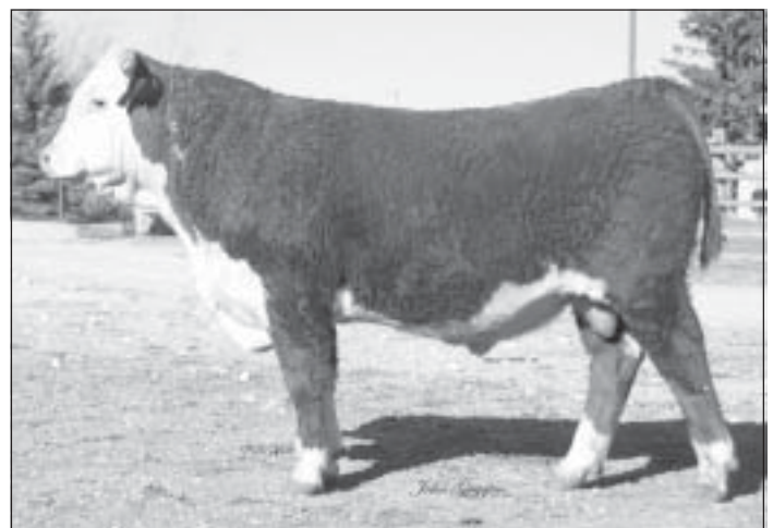
HH Advance 4163P

♦Square hipped, well marked bull with moderate birth and strong growth numbers.