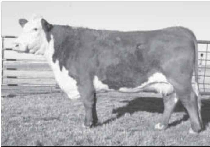
HH Ms Advance 8037H Dam of Lots 4013P & 4075P Maternal Grandam of Lot 4126P