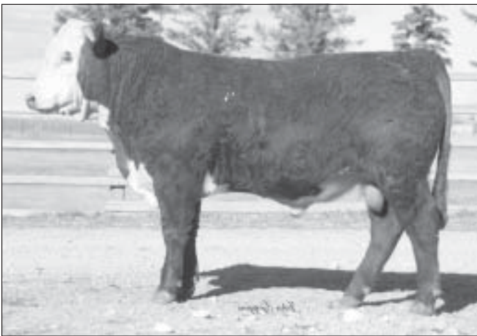
HH Advance 4075P