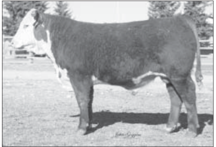
HH Advance 4191P

♦ "4191" is probably the best all around herd bull prospect we have raised out of 986. He is well marked, long, and has plenty of muscle expression. When you combine that with only an 89 lb. birth weight and his great performance numbers, he looks like he could be a real herd improver. Also, his dam is a big, high volume, freckle faced power cow with a great udder. She is a maternal sister to our great 8037 donor cow.