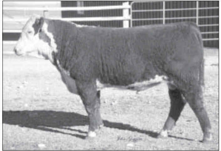
HH Advance 4079P