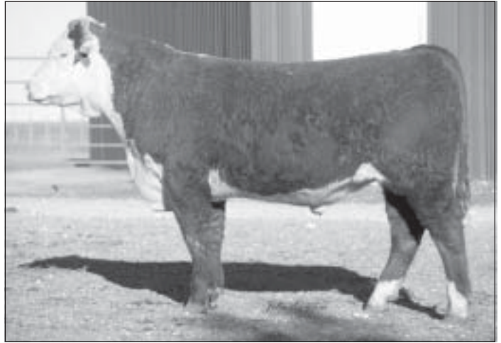
HH Advance 4188P

♦ "4188" is a top herd bull prospect that has everything right about him. He has only an 88 lb birth weight, is the #1 bull in the sale on nursing ratio, excellent growth, maternal, and carcass EPD's and is a well marked, clean made bull with plenty of thickness. His dam is a role model brood cow with an average NR of 105 and a perfect udder. We plan on flushing her this spring. A 3/4 brother to 4188 was one of our top bulls last year and sold to Ochsner's in Wyoming.