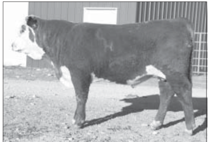
HH Advance 4044P

♦ Powerful herd bull prospect that combines great individual performance, EPD's, and phenotype. "4044" is another top son out of the great 793 donor cow that has produced over $60,000 of progeny and has sons working for Cooper Herefords, Harrell Herefords, W4 Ranch, Ledbetter Cattle, and Jacobs Ranch. He is very well marked, loaded with muscle, and scanned a 14.9 inch REA.