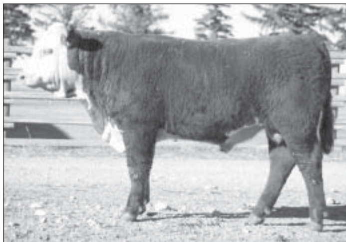
HH Advance 4065P

♦ Herd bull prospect that is very complete in his makeup. "4065" is well pigmented, clean made, and stylish. Full brothers sell as Lots 4034P and 4095P.