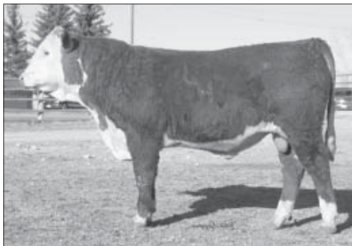
HH Advance 4068P

♦ Top quality herd bull prospect that combines a moderate birthweight with phenomenal individual performance. "4068" is a big dimensioned bull with tremendous eye appeal. He is very clean made with lots of length and top. He is the #2 bull in the sale on both weaning and yearling ratios and scanned a 14.1 inch REA.