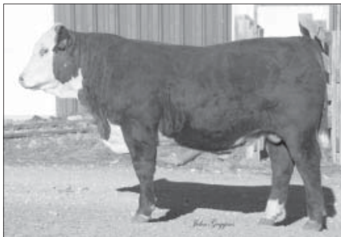
HH Advance 4120P

♦“4120” is a moderate framed, moderate birthweight bull with extra pigment and muscle. He has a great set of EPD's and scanned a 15.1 inch REA. His dam is a picture perfect female and will be put in our donor program this spring. His maternal grandmother is a donor cow for us also and is a daughter of the great 339 cow.