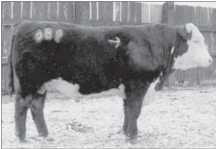
CL 1 Domino 986J

BD: 1-20-99 ♦ Reg: 41113238 ♦ Tattoo: 986 ♦ Bull