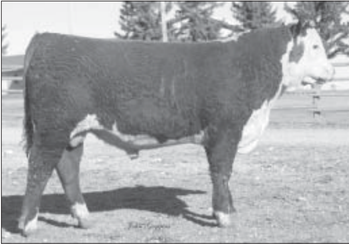
HH Advance 4024P

♦ "4031" is a top quality herd bull prospect with powerful individual performance. He is well marked, long, thick, and easy on the eye. Dam has been one of our top donors and produced the 2 top sellers in our 2003 sale. She is a great producer and has an average NR of 106 and an average YR of 106. A full brother sells as Lot 4044P.