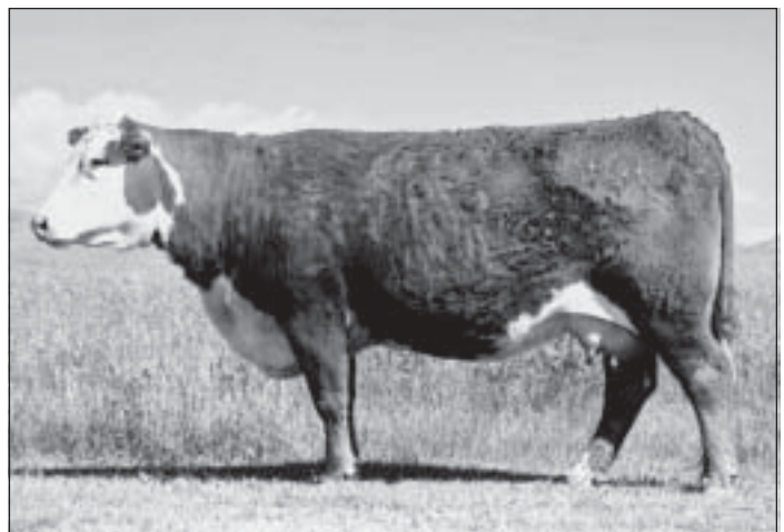
CL 1 Dominet 496 1ET Dam of Lots 4024P, 4028P, 4079P, 4080P, and 4084P Dam of Herd Sire CL 1 Domino 986J

♦ "4075" is a top notch herd bull prospect that is loaded with red meat. He is a big topped, deep sided bull with tremendous muscle expression down through the stifle. He is also 100% pigmented and has phenomenal EPD's that rank him in the top 8% of the breed for YW, Milk, M&G, Scrotal, and REA EPD's. He backs it up with powerful individual performance, and he scanned a 14.6 inch REA. His dam is a moderate framed, power cow that boasts a 112 average NR. She also raised our 396N herd bull that we are so excited about and a full sister to 4075 was the pick of our heifer calves that sold at Denver for $12,000.