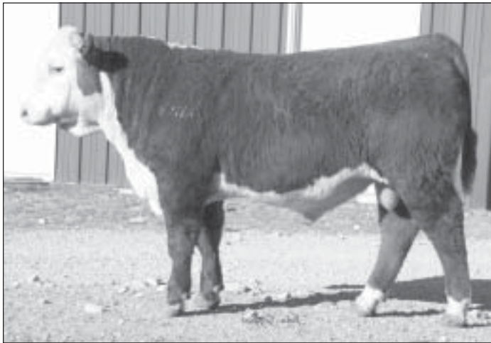
HH Advance 4100P

BD: 1-17-04 ♦ Reg: 42475800 ♦ Tattoo: 4104 ♦ Bull