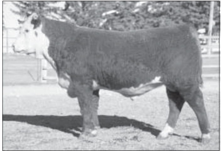
HH Advance 4055P

♦ Moderate birthweight bull with strong growth and carcass EPD's. Dam is a high volume, super uddered female with 100% pigment.