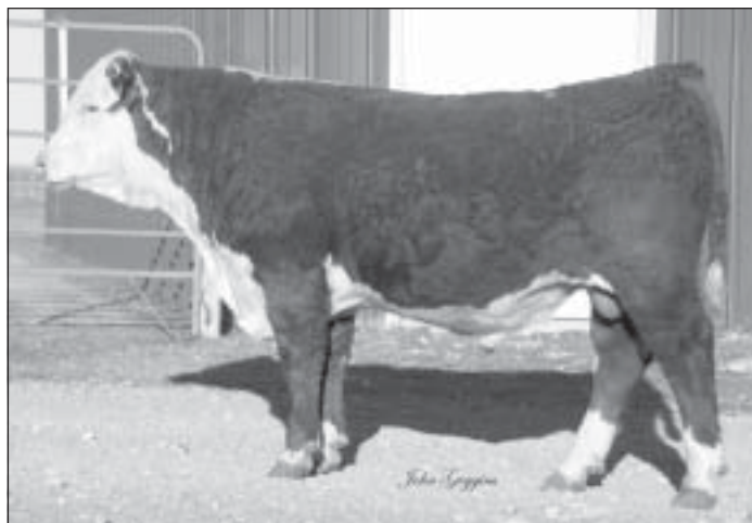
HH Advance 4121P

♦“4121” is probably the most powerful herd bull prospect we have ever had by the Cooper 0124K bull. He combines an 88 lb. birthweight with phenomenal performance numbers. He is a long bodied, deep sided bull with lots of muscle expression. To top it off, he is a maternal brother to the 399N bull that topped last year's sale to Edgar Herefords in Texas for $23,000. His dam has an outstanding record and is a granddaughter of the 339 cow also.