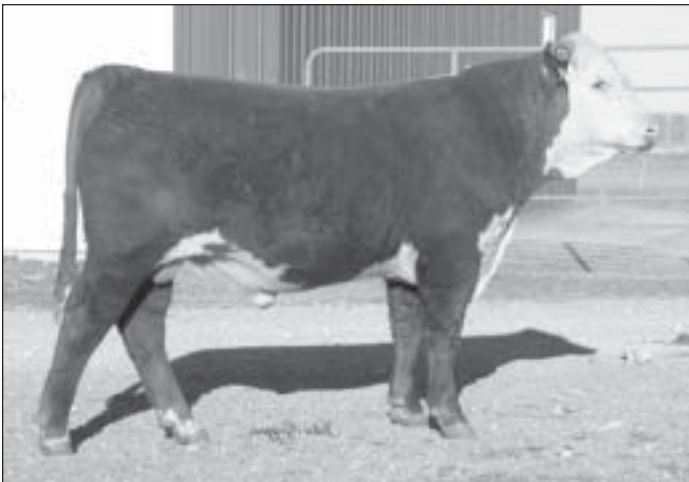
HH Advance 4031P

"Thank you for your interest in our program. Please feel free to stop by and inspect the cattle at any time, and if we can help you out in any way, please give us a call."