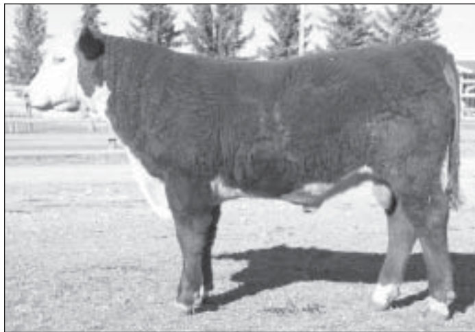
HH Advance 4089P

♦Great set of curve bending EPD's and powerful individual performance in this extra long, well marked 2136M son. Note the 793G cow on the bottom side of his pedigree.