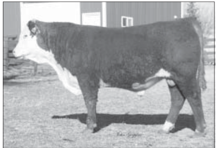
HH Advance 4095P

♦Balanced trait bull with good muscle expression. "4093" has a little extra chrome and would be great in a crossbreeding program.