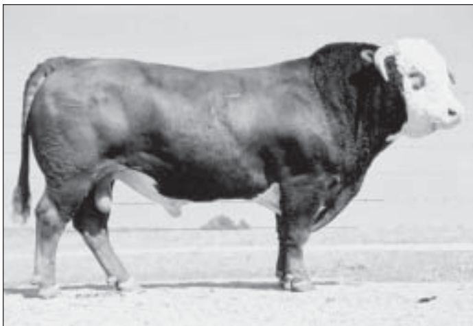
HH Advance 0024K

BD: 1-22-00 ♦ Reg: 42050495 ♦ Tattoo: 0024 ♦ Bull