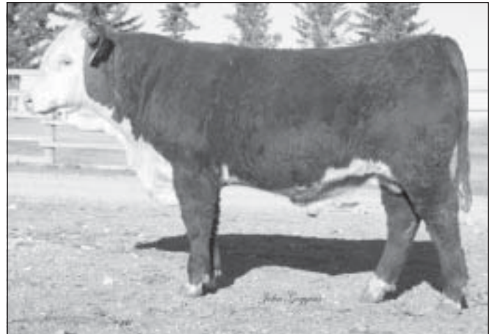
HH Advance 4118P

♦ Light birthweight bull with strong growth and maternal EPD's. "4112" was one of the top bulls on scan data with a 13.6 inch REA and a 128 on marbling ratio. His dam is a top young female and a full sister to our 216 herd sire.