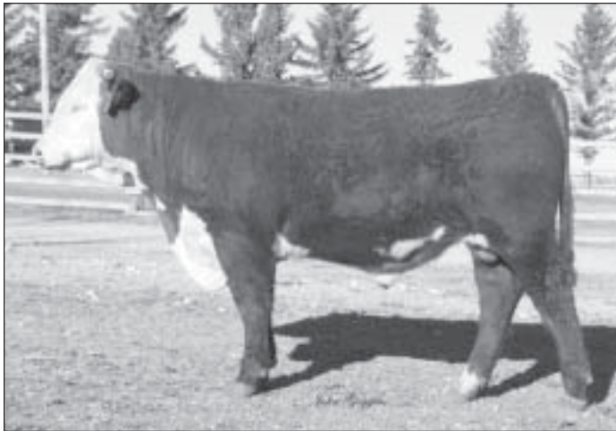
HH Advance 4047P

♦ "4055" is a big topped, square hipped, correct made herd bull prospect with good pigment and eye appeal. He is also one of the top bulls in the sale on scan data with a 13.6 in REA and a 122 on marbling ratio. Dam is a very feminine, perfect uddered cow with an average NR of 105 and an average YR of 105.