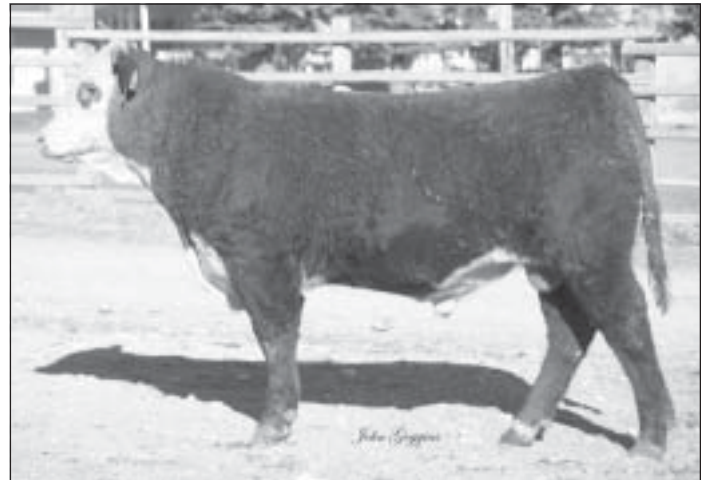
HH Advance 4140P

♦ "320" is a very well marked, moderate framed bull with great EPD's across the board. He was one of our favorite bulls at Cooper's last year and their 3rd high seller to Eulert Ranch. We purchased him back in their dispersion and plan on breeding a select group of heifers to him this spring. Dam is a high volume, super uddered cow. Owned with EE Ranches, KS and MS