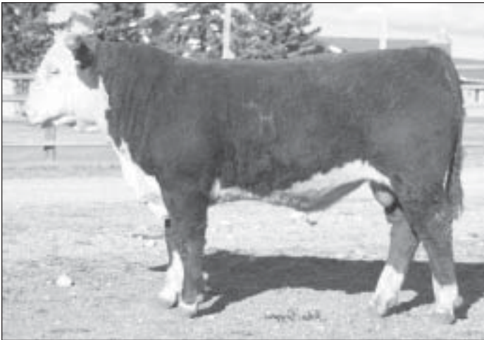
HH Advance 4080P

♦ Another quality maternal prospect out of the 496 Cooper cow. "4084" is well marked and good patterned with a +24 on Milk EPD.