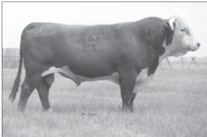
HH Advance 0094K

BD: 2-28-00 ♦ Reg: 42050662 ♦ Tattoo: 0094 ♦ Bull