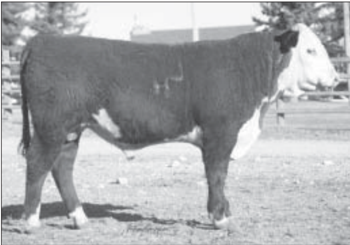
HH Advance 4028P