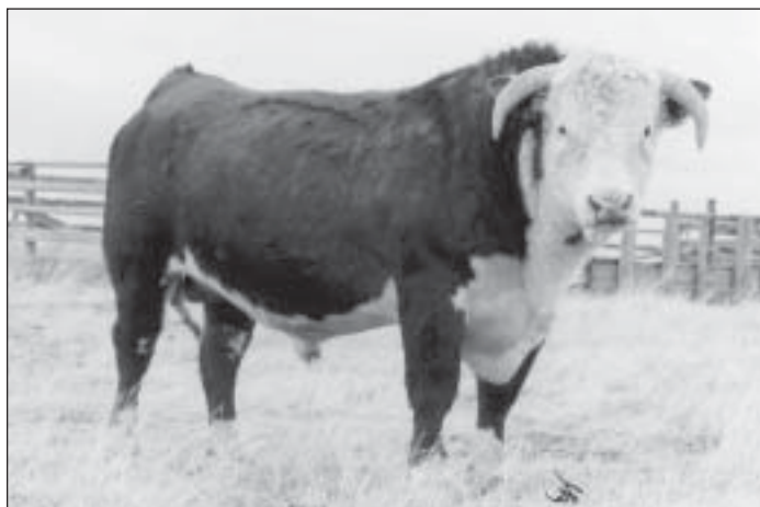
CL 1 Domino 206M

BD: 1-04-02 ♦ Reg: 42270213 ♦ Tattoo: 206 ♦ Bull