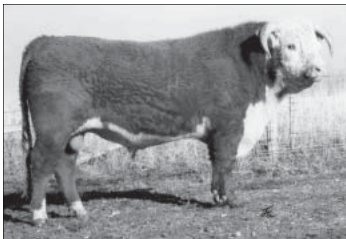
HH Advance 145L

BD: 1-07-01 ♦ Reg: 42151076 ♦ Tattoo: 145 ♦ Bull