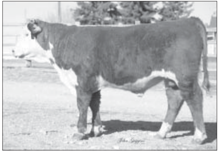
HH Advance P41

♦ Stout made well marked 0094K son out of a high volume, easy doing 6052 daughter.