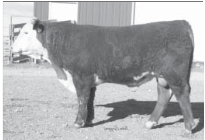
HH Advance 4085P

♦ "4080" is a super attractive, wide topped herd bull prospect that is very clean fronted and correct. He is tied for the #1 bull for Milk EPD in the sale and scanned a 13.8 inch REA. A ¾ brother to this flush of bulls was our second high seller last year to Zurn Herefords and Sidwell Herefords, CO. If you are looking for a guaranteed maternal sire that also has thickness, 4080 would be a great choice.