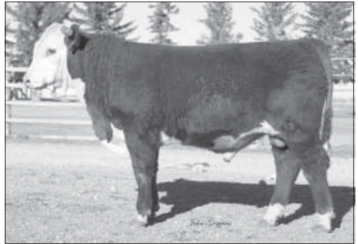
HH Advance 4045P

♦ Herd bull prospect with extra pigment, volume, and muscle expression. Dam is our top 6052 daughter and an ideal female in every way. She is a perfect uddered and boasts an average NR of 110. Full brothers sell as Lots 4065P and 4095P.