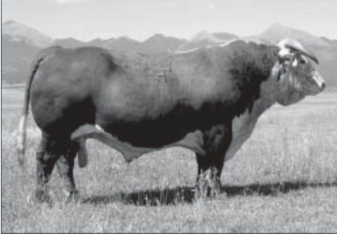
L1 Domino 99496