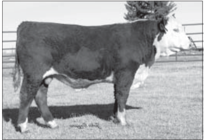
HH Advance 5101R

♦ Short marked bull that does a lot of things right. "5098" has a BW EPD that ranks him in the top 10% of the breed along with being in the top 10% for YW, Scrotal, and IMF EPD's. He has a ribeye ratio of 101 and a marbling ratio of 117. Dam is a 3/4 sister to the 145L bull that we used and a great female.