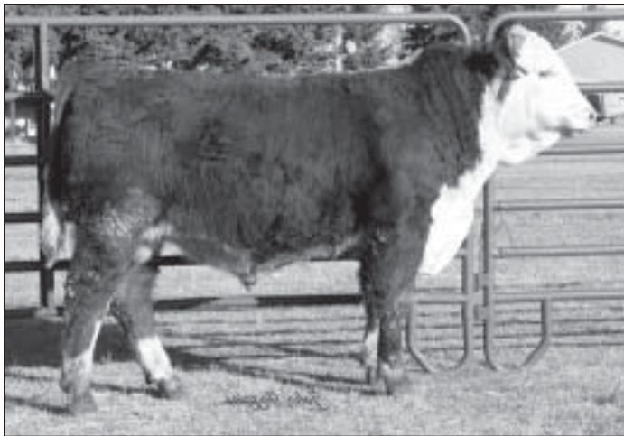
HH Advance 5176R