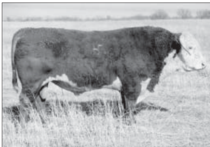
CL 1 Domino 2136M