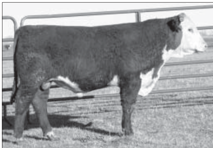
HH Advance 5091R

♦ Moderate framed, easy doing bull with coon eyes and a great disposition. "5090" should make a great heifer bull. Dam is a super 0024 daughter with lots of pigment and a great udder.