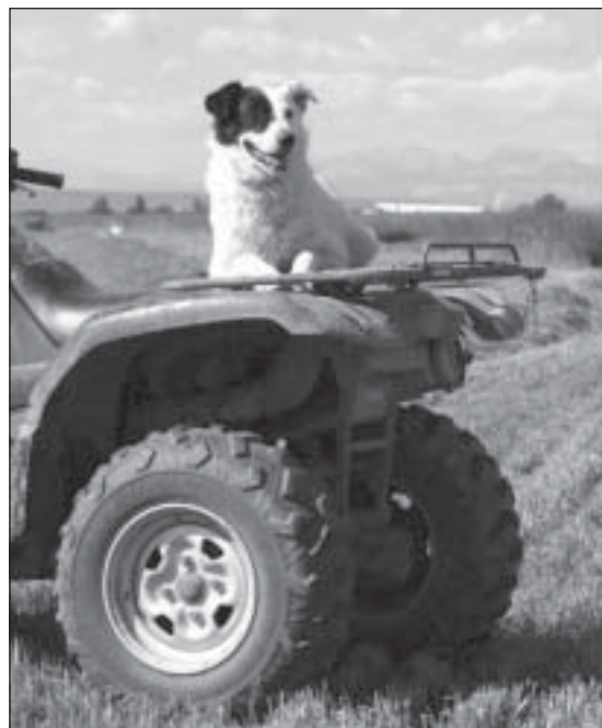
Bubba patiently waiting for Jack to get done swathing