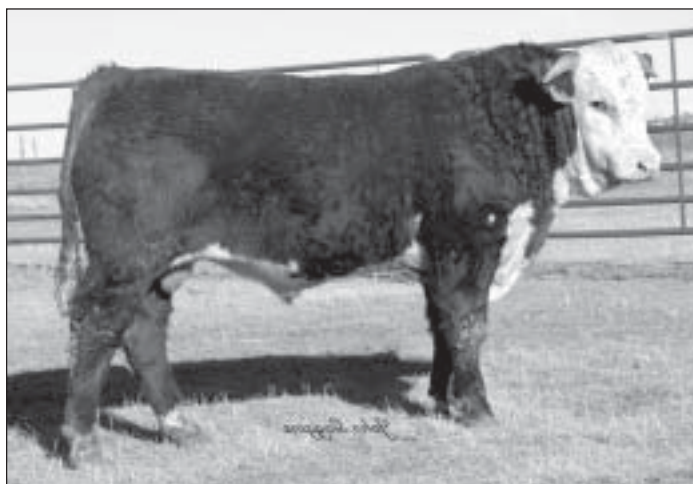
HH Advance 5033R

Research has proven that a properly conducted crossbreeding program of Hereford bulls on Angus cows can increase beef productivity during that cows lifetime by almost 30%.