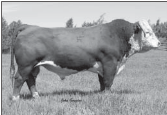
CL 1 Domino 206M