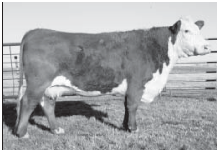
HH Miss Advance 8037H Dam of 396N herd sire and Lot 5117R

♦ Well marked, consistent performing 373 son out of a great cow family.