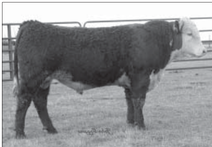
HH Advance 5117R

♦ Extra thick, easy doing bull with balanced EPD's and good performance.