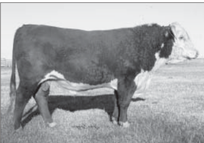
HH Advance 396N