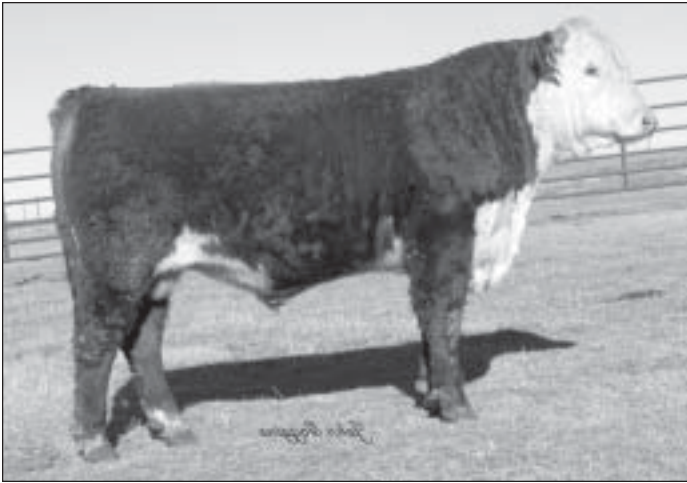
HH Advance 5191R