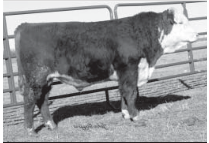
HH Advance 5205R

♦ Strong performance and carcass bull. "5199" ranks in the top 10% of the breed for IMF EPD. Dam has an average NR of 104 on 3 calves.