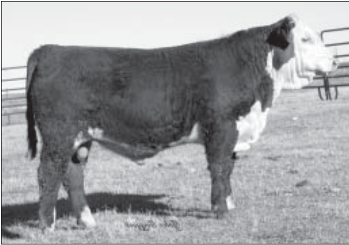
HH Advance 5161R