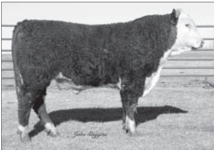
HH Advance 5085R