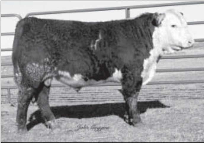
HH Advance 5224R