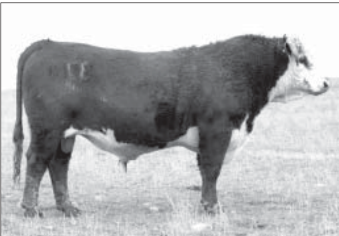
CL 1 Domino 373N ET