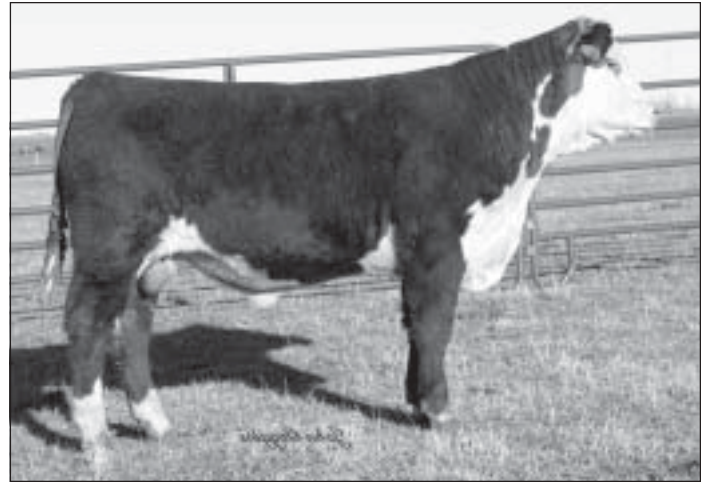
HH Advance 5194R