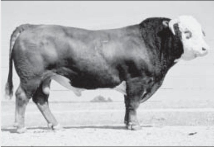
HH Advance 0024K