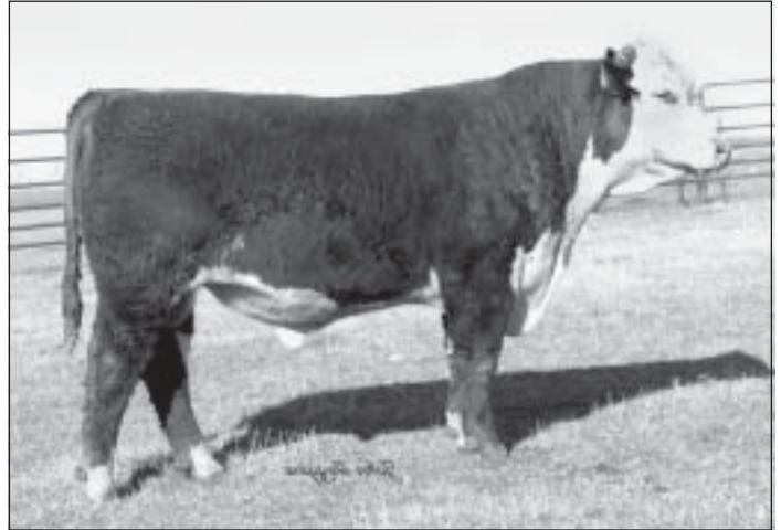
HH Advance 5061R

♦ Balanced trait bull with powerful numbers across the board including carcass. There are 3 generations of donor females behind this bulls dam including the great 251 cow.