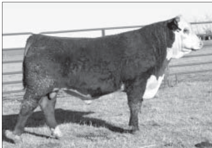
HH Advance 5012R

♦ Powerful herd bull prospect with extra length, volume, frame, and 100% pigment. "5012" was the second highest YW bull with an adj. 365 of 1431 lbs. He has phenomenal EPD's that rank him in the top 10% of the breed or better for WW, YW, Milk and M&G EPD's and is the #2 bull in the sale on WW and YW EPD's and tied for #1 for M&G EPD. He also is the #1 bull in the sale on marbling ratio with a ratio of 144 plus he had a ribeye ratio of 106. Dam is a perfect uddered 824 daughter with an average NR of 109 and an average YR of 107.