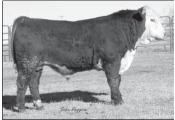
HH Advance 5170R

♦ "5161" is an outstanding herd bull prospect that is probably the top performance and maternal bull in the sale. He is extra deep sided, thick, well marked, and easy on the eye. His dam is an easy doing, power cow with red pigment on her teats. She produced a herd bull for Spencer Herefords, NE. in last year's sale and is from the same cow family as our 216 herd sire. We really wanted to keep this great bull, but we just have too many females that are related to him to be able to use him enough. We are retaining a 1/4 in-herd semen interest so that we can use him in our ET program.