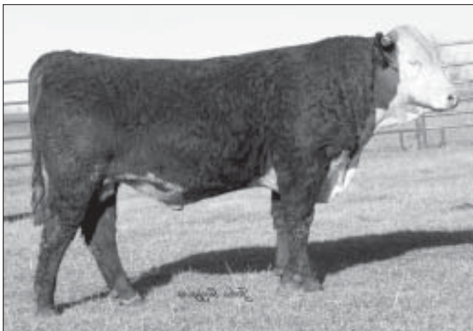
HH Advance 5145R