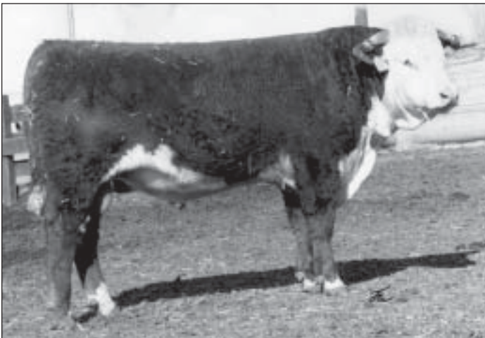
CL 1 Domino 180L