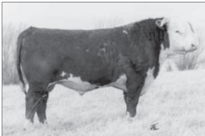
HH Advance 216M