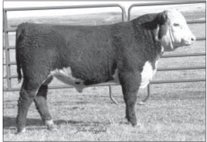
HH Advance 5079R

♦ Solid performing, thick made 206 son with excellent EPD's.