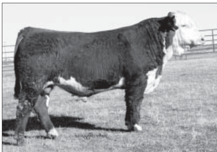
HH Advance 5212R

♦ Well pigmented, nice made bull out of a full sister to the 3179 bull that we used. "5211" ranks in the top 3% of the breed for IMF EPD.