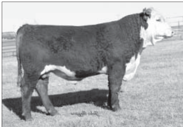
HH Advance 5011R

♦ Heavily pigmented, extra thick herd bull prospect with strong individual performance and EPD's. "5011" ranks in the top 20% of the breed or better on seven different EPD's including the top 5% for IMF EPD. Dam is a top donor cow and produced a herd bull for Cooper Herefords in last years sale.