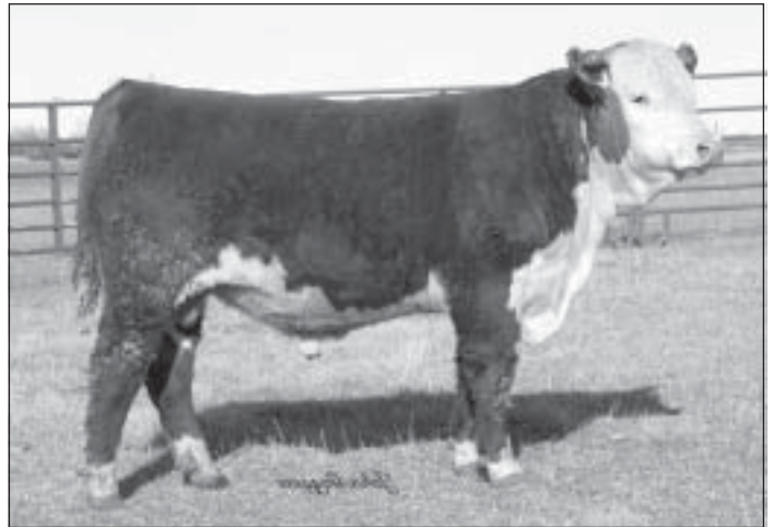
HH Advance 5007R

♦ Long bodied, clean made bull with very balanced EPD's. "5006" really performed well on test. Maternal grandam was a donor cow for us.