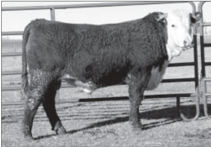
HH Advance 5122R

♦Moderate framed, easy fleshing 99496 son with good pigment. "5119" had a 120 on marbling ratio. Dam sold for $6500 to Rotello Farms, TX. last fall.