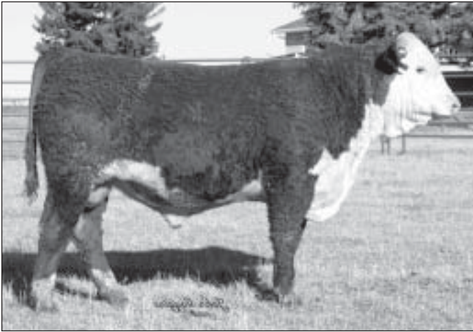
HH Advance 5068R