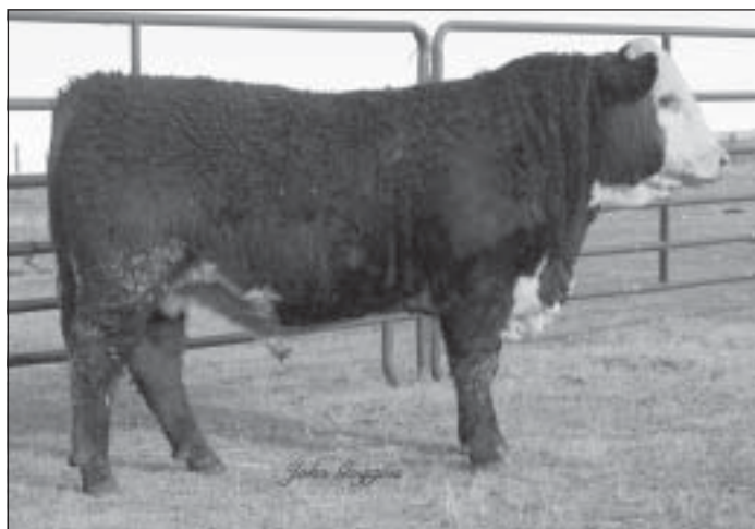
HH Advance 5156R

♦ "5155" is another 0024 son that is full of red meat. Note his +.29 REA EPD.